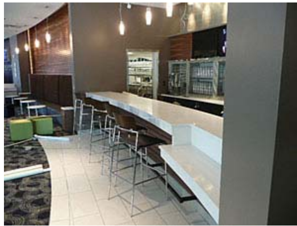
Top Master recently completed front reception and bar area work for Studio Movie Grill, which features DuPont Zodiaq.